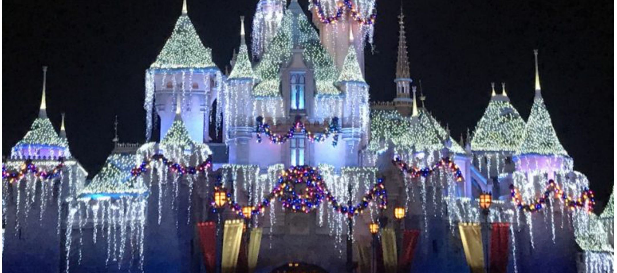
Holiday lights at Disneyland.

There’s no place like the House of the Mouse for the holidays. From the towering tree on Main Street to the bright-blue icicles dangling from Sleeping Beauty’s castle, Disneyland’s Christmastime conversion is always a stunning feat. The Haunted Mansion mashup of jack-o’-lanterns and Santa hats remains a most delightful nightmare carrying over from Halloween Time. It’s a Small World is just as shimmering with its season’s greetings décor inside as it is when the ride’s famed façade’s Christmas-colored bulbs light up at dusk. Add such decadent holiday treats as candy cane beignets and fun parades for kiddos to max the merriment. Remember to eat a gingerbread Christmas churro and thank a cast member! And good luck trying to find one of those Disney holiday-spirited jerseys while you’re there. 1313 Disneyland Dr., Anaheim; disneyland.disney.go.com . Check website for hours. Through Jan. 6, 2019. $97-$133.